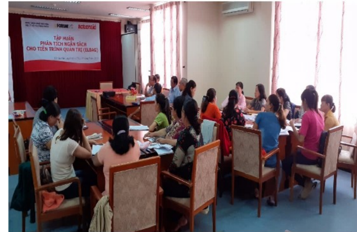
CDG members at the ELBAG training in LRP102

The findings revealed that 8/10 service quality criteria scored under 7 on the scale from 1 to 10. Noticeably, the central drainage system had not reached the households; a number of manhole covers were missing, threatening people's safety. The duty bearers agreed with these feedbacks and presented their action plans to address the identified issues.