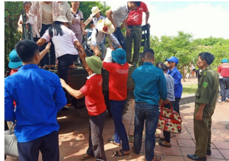
Local people in LRP25 applying emergency first aid and evacuation skills at the mock drills.