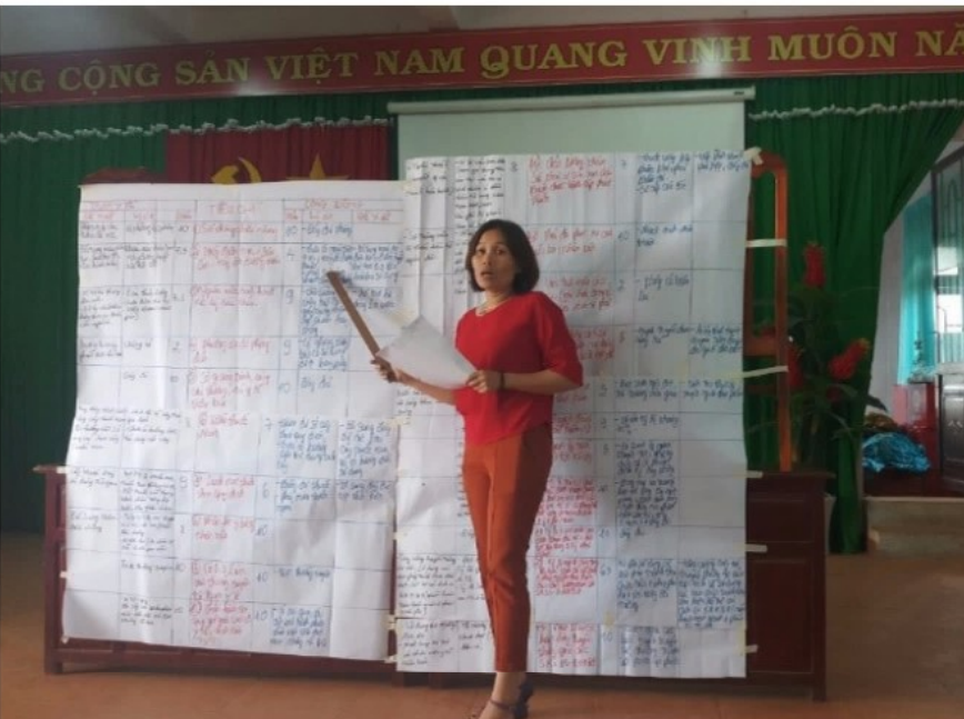
A woman presenting the findings of social audits in LRP18