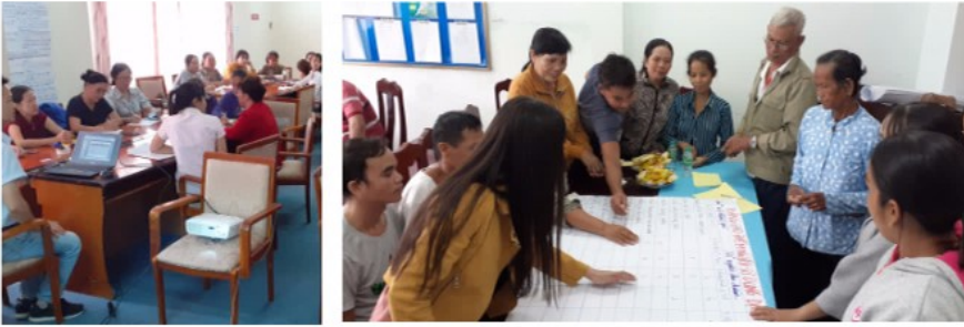
Women-led CDGs practicing social audit tools in LRP102