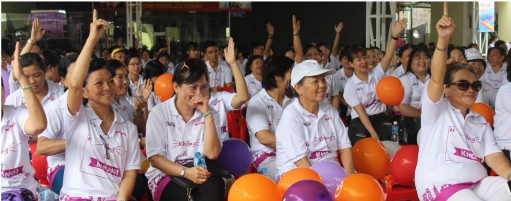
Women in Binh Tan district at the music event "Rhythm of Joy" campaigning for prevention of sexual harassment.

"AAV works closely with local partners and stakeholders to implement practical and effective programmes, and ensures compliance to the reporting and information requirements of HUFO and other managing agencies." , shared HUFO representative. She also stressed that it is most important that AAV takes the proactive role in collaboration with local partners to develop and conduct programmes and projects that are relevant to the needs of the communities.