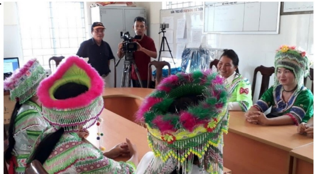
Journalists recording the discussion on SHR among ethnic minority women in LRP18.

Equiped with practical knowledge and grassroots-level evidence, these journalists became inspired activists that will join hands with the local communities in voicing their needs to duty bearers and advocate for changes in policy and practices. Specifically, they will participate in the project's activities and broadcast news on the improvements in public SRH services for the women and youth of ethnic monirities in LRP18 and LRP19.