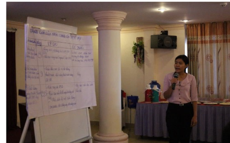
A CDG representative presenting findings of the survey on local drainage systems