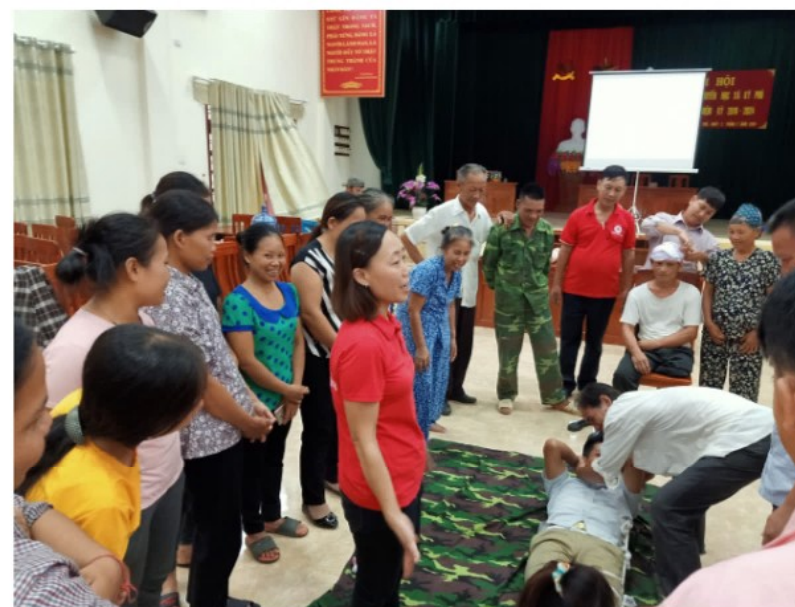
Local people in LRP25 practicing emergency first aid skills.