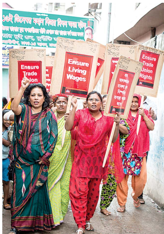
Rights Café women marching down the street in Bangladesh.

Guaranteeing freedom of association and collective action is particularly important. Feminist scholars have repeatedly come to the conclusion that a key precondition for women to really achieve empowerment is their active and open participation in voicing injustice and shaping fairer institutions and processes for them to be part of. For example, the waste pickers union in India "lobbied to get the municipal government to issue them with identity cards and extend the right to basic social security, bringing them into the formal arena." 188